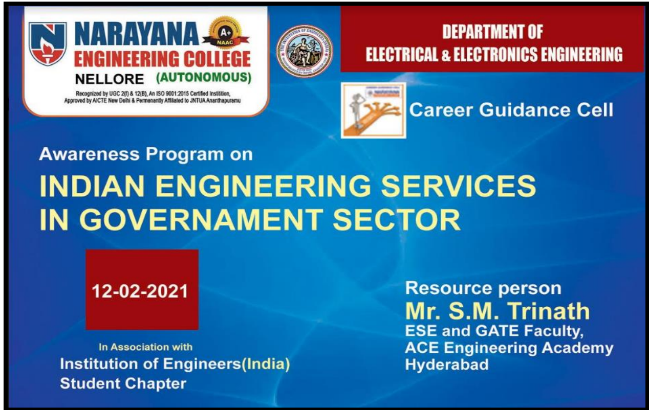
Awareness Program on Indian Engineering Services